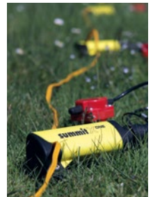
Recording equipment suitable for different type of field applications